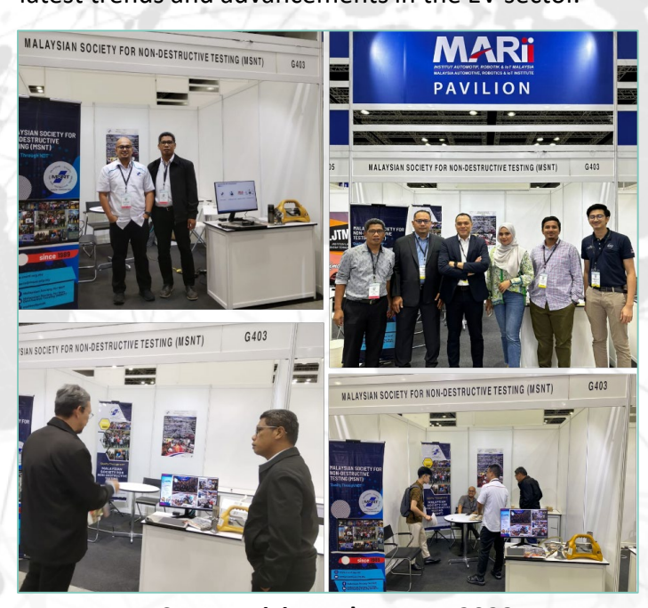
MSNT participated as EMA 2023

(EMA) 2023 event held at the Kuala Lumpur Convention Centre from November 22 to 24, 2023. Supported by the Electric Vehicle Association of Malaysia (EVAM), EMA 2023 focused on sustainable electromobility, particularly electric vehicles (EV). MSNT embraced this opportunity to engage with industry leaders, technology experts, and enthusiasts, contributing to the discourse on the latest trends and advancements in the EV sector.