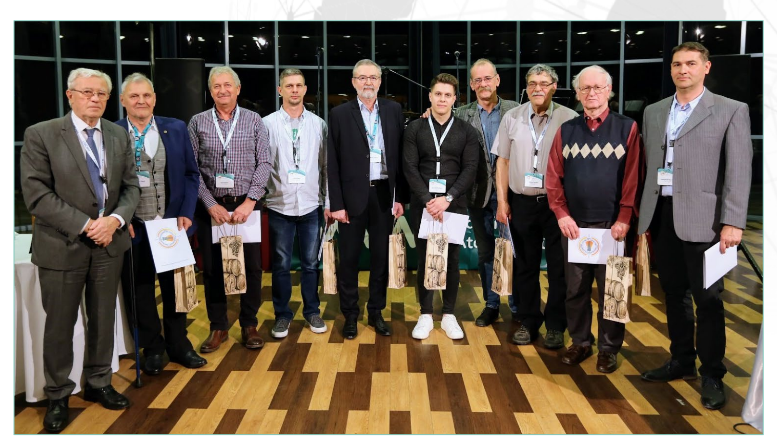
The group photo of the 25-year membership award winners